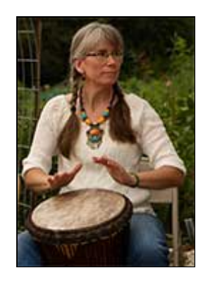
Laurie Blue Heron